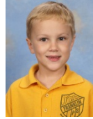
Chad – 1H