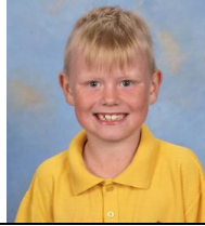
Dakota – 3M