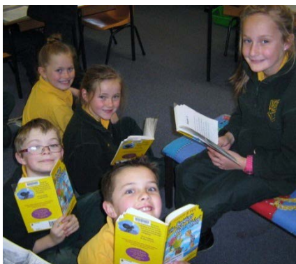
Our Accelerated Literacy text this term is the very funny, Bugalugs Bum Thief by Tim Winton.