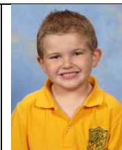
Preston - KM