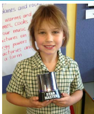
Emily's light uses batteries.