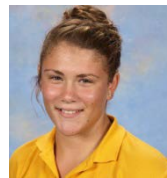
Piper Duck 1 st 12 Yr Girls ( R )