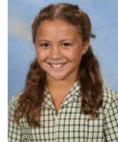
Leith – 4W