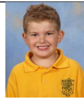
Preston – 1C